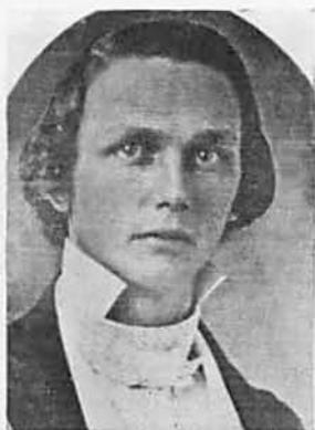
William Dudley Battle (about 1845) Table 87