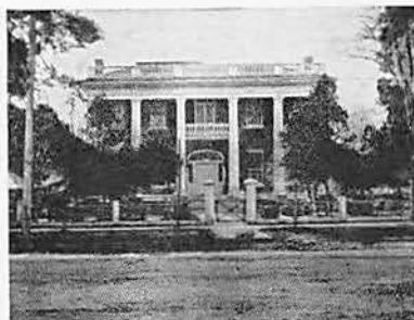
Alfred Battle Home (erected 1840) Tuscaloosa, Ala. Table 76