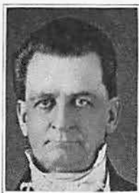
Gov. Henry Watkins Collier (1852) Table 85