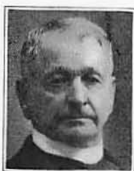
Judge Nicholas William Battle (about 1895) Table 79